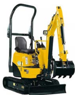
1t Excavator (Width 680mm)

At Kelm Hire, we offer a wide range of excavators to suit all your excavation needs. From small-scale projects to large-scale construction sites, we have the right equipment for the job. All excavators come with extra attachments such as hydraulic grabs, breakers, auger drive units and drill bits to suit, sleeper grabs and much more.