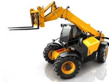
2.5 Tonne JCB Telehandler (6m Reach)