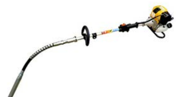
Portable Vibe Shaft