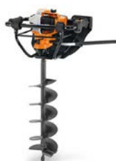
Post Hole Diggers