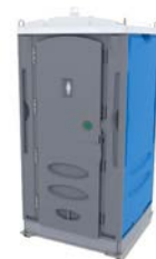
Portable / Chemical / Plumbable Toilet