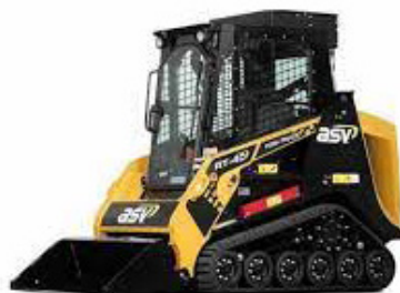
ASV Posi Tracks