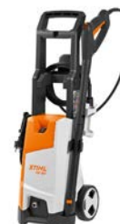
2000 PSI Electric Washer