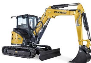
5t Excavator (Width 2m)