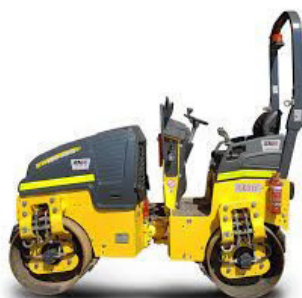
Smooth Drum Rollers