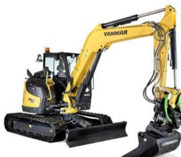
8t Excavator (Width 2.3m)