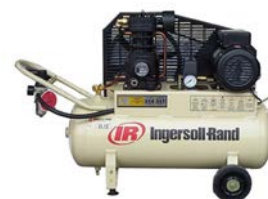
17 CFM Compressor