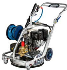
4000 PSI Rotary Walk Behind Pressure Washer