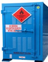
Outdoor Flammable liquids storage 160L