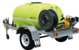
Towable Water Cart