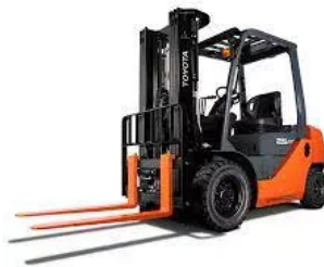
3.5 Tonne Toyota Forklift