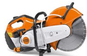
Demolition Saws 14 & 16 Inch