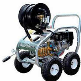
3000 PSI Pressure Washer