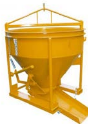
Concrete Kibble Bucket 1m & 1.5m Cube