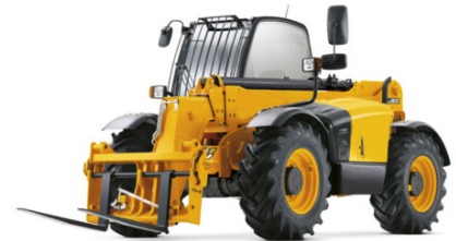
3 Tonne JCB Telehandler (12m Reach)