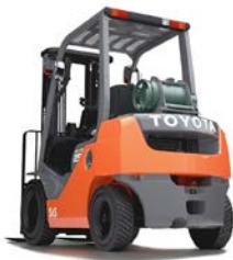
2.5 Tonne Toyota Forklift

Our top-of-the-line Manitou and JCB Telehandlers are designed to excel in even the most challenging work environments. With exceptional performance and durability, our forklifts are the perfect solution for heavy-duty industrial applications.