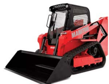
1050RT & 1650RT Manitou Posi Tracks

Don't see what you are looking for "Just Ask"... Contact Us Today ☎ (03) 9534 8904