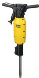
Air Breaker 27KG