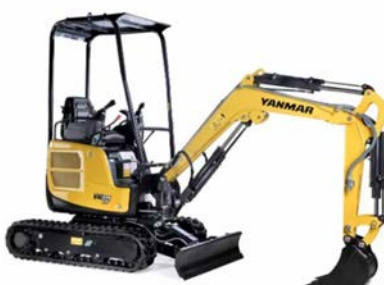
1.7t Excavator (Width 1m)