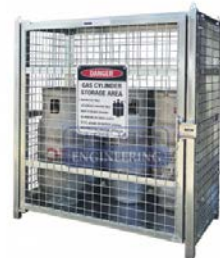
Gas Cage / First Aid Cage / Crane Boxes