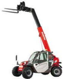
2.5 Tonne Manitou Telehandler (6m Reach)