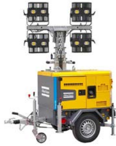
LED Directional Light Tower