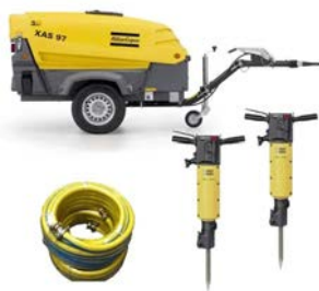
175 CFM Towable Compressor