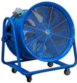
600mm Extraction Fan