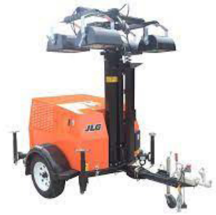
JLG Light Towers