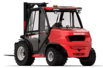
2.5 Tonne Buggy Manitou Forklift