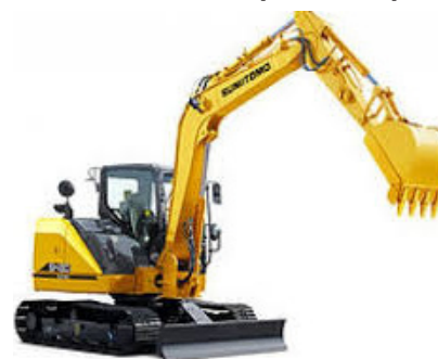
14t Excavator (Width 2.49m)