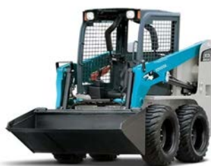
1.8T Toyota Bobcat

Kelm Hire offer a wide range of Posi-Tracks and Bobcats, two of the most versatile and popular types of compact tracked and wheeled loaders in the industry. With exceptional manoeuvrability and power, these machines can handle a wide range of tasks.