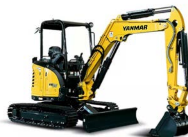
3.5t Excavator (Width 1.5m)